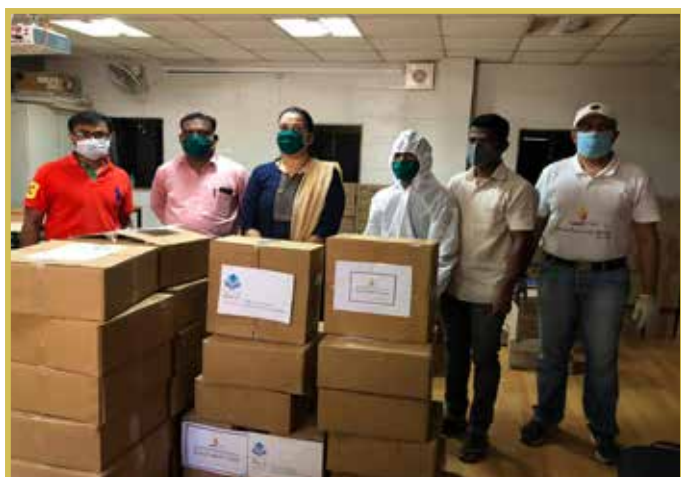
PPE Kits for frontline Covid warriors