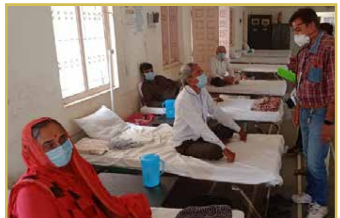
Support to Covid Centre in Patan, Gujarat

To ensure maximum impact, all activity was undertaken in coordination with the Governments of Maharashtra and Gujarat, as well as local government authorities (District administration, panchayats and municipal bodies) and in association with charitable organisations and NGOs which worked at the grassroots level.