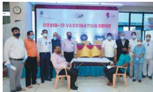
Vaccination centre in Dahisar

Soon after the mega Vaccination drive began in India, GJNRF stepped forward to make it possible for diamond artisans and daily wage assorters across the city of Mumbai to receive their doses.