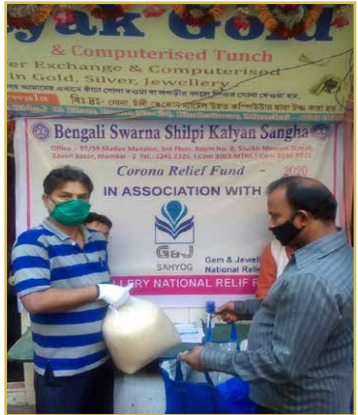
Foodgrains to industry artisans in Zaveri Bazar, Mumbai

The major focus was on food distribution and taking care of the artisans and migrant workers on the one hand, and equipping the frontline Covid warriors in hospitals and police station with safety kits and medical supplies to ensure their personal safety.