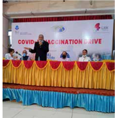
Vaccination Camp for Diamond Artisans