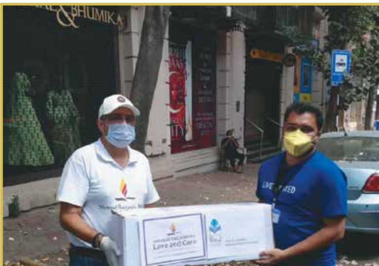
Food packets for distribution to migrant labourers

Both when distributing emergency rations during the lockdown and supporting frontline caregivers or later in strengthening medical infrastructure, GJNRF's response to the Covid crisis in 2020 and 2021 provided direct and indirect assistance to a very large number of people and helped them cope with the unprecedented onset of the pandemic.