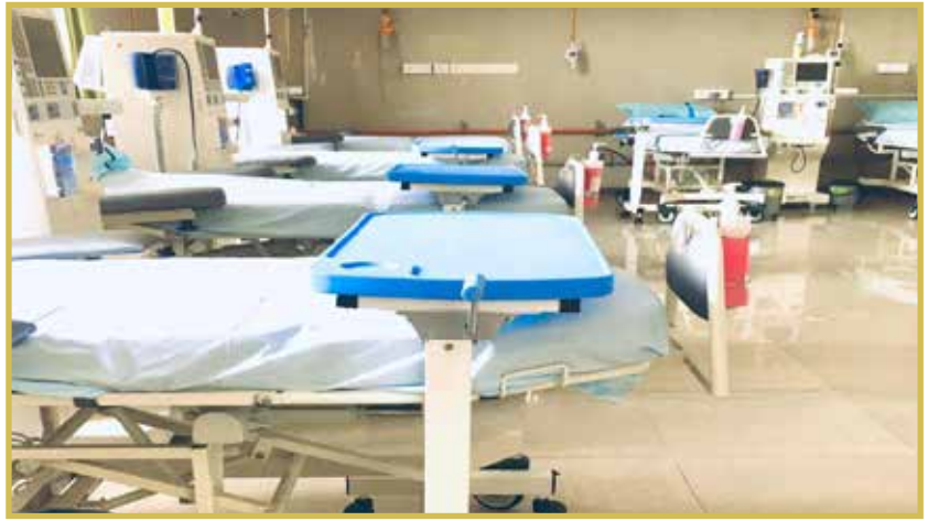
Ventilators at Cooper Hospital, Mumbai

For eg. The beds and remaining stocks of medical supplies given to the Tardeo Quarantine centre were subsequently passed on to two Anath Ashrams in Vasai, near Mumbai.