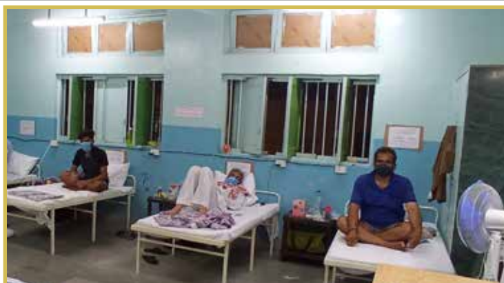
Covid Care Centre, Tardeo, Mumbai

After the wave peaked and then subsided, the beds and the remaining useful stocks of medical supplies were donated to two Anath Ashrams (orphanages) in Vasai, near Mumbai.