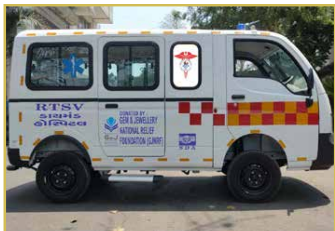
Ambulance donated to Surat Diamond association Hospital