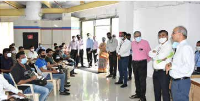
Vaccination Camp for Daily Wage Assorters at BDB