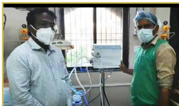
Ventilators donated to a hospital in Mumbai