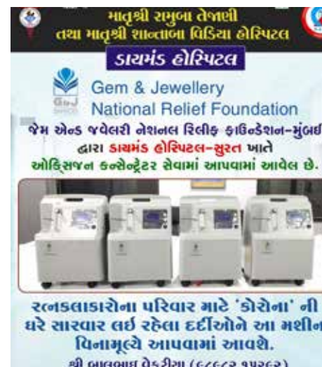
Equipment donated to Diamond Hospital, Surat