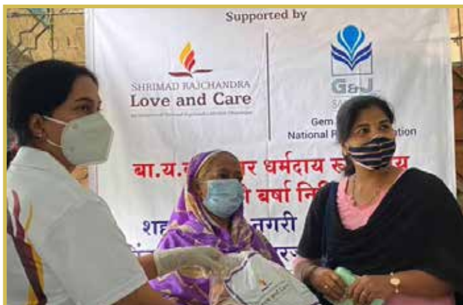
Distribution of Emergency Rations in Mumbai