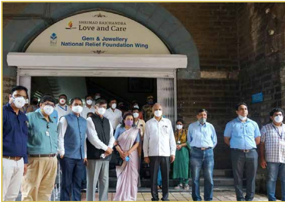
Renovation of Wing at St George's Hospital, Mumbai